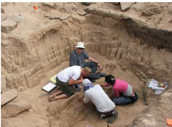
Excavation site.