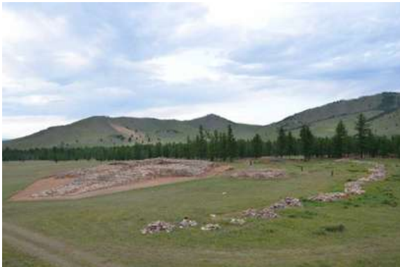
Gol Mod-II site.

After breakfast, we will drive to the main destination of our journey, the Gol Mod 2 site, located in the beautiful Khanui Valley. Gol Mod-2 is located at the base of the Bugatiin Nuruu Mountains and measures about 2.2 kilometers by 1.3 kilometers. There are over 98 large tombs, each comprised of a ramp leading up to a level platform. The largest of these tombs has a 3-meter-tall platform and measures 83 meters in length. There are also about 335 smaller burials at the site, marked by stone