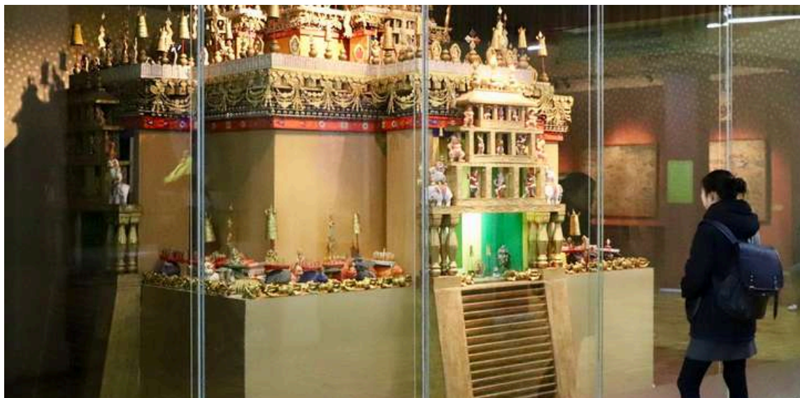
The Fine Arts Zanabazar Museum

After lunch, we will visit the Zanabazar Fine Arts Museum, which boasts an outstanding collection of Mongolian art, including 17th-century golden Buddha statues and some of the best-preserved tankas in the world. Alternatively, you will have the opportunity to explore shopping options, including visits to cashmere factory outlets and stores selling genuine Mongolian products.