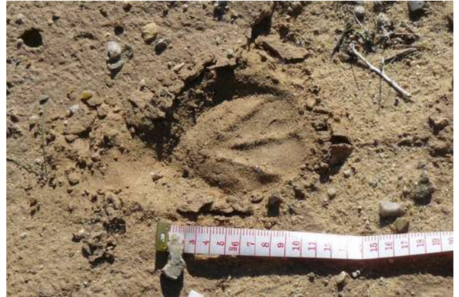
Measuring tracks of a Mongolian khulan on the soil.

(Approximately 150 km; Tented camp; B, L, D)