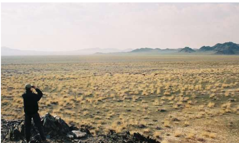
Observation of Gobi wildlife using binoculars

After lunch and a short visit to the area, we will set up a few camera traps in the surroundings. Overnight in tents or gers, depending on availability. (Approximately 330 km. Tents; B, L, D)