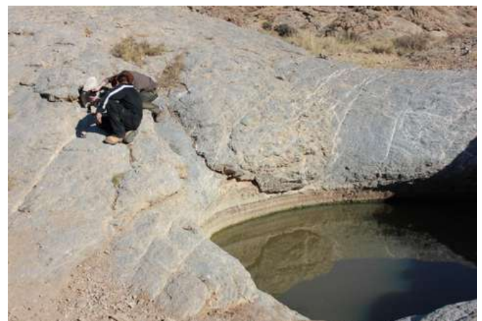
Set up of a camera trap at a water point with Protected areas' rangers

While we stay at the same camp for another night, we shall take packed lunches and explore nearby localities with possible watering holes of the Khulan, including one at Lugin Gol. We will also meet with one family of herders that live in this area. You will be able to have an insight of the daily activities of the nomad family of the Gobi Desert. (Approximately 200 km; Tented camp; B, L, D)