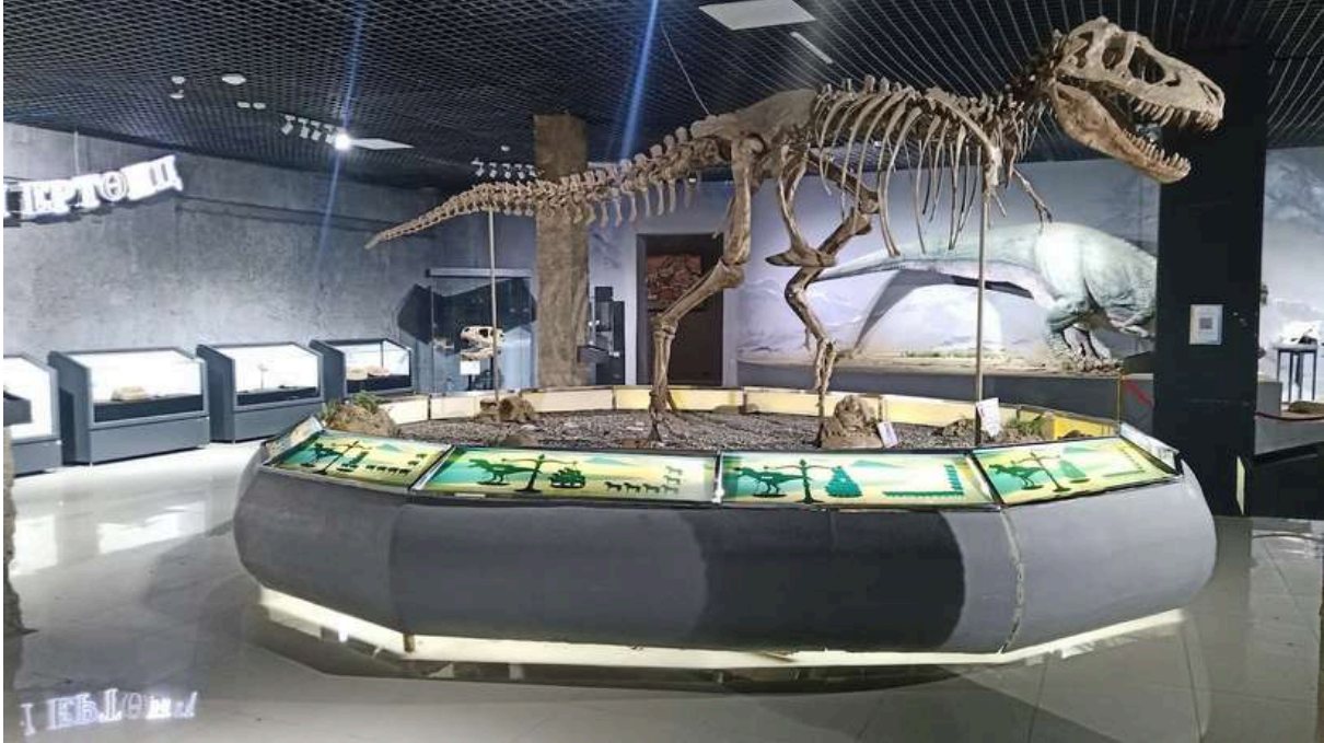
Natural History Museum of Mongolia. “Mesozoic Era” hall

Next, we will visit the National History Museum located in downtown Ulaanbaatar. This museum provides an excellent introduction to Mongolia's history, from prehistoric times through the 13th-century Mongolian Empire, and up to the democratic movement of the early 1990s, which overthrew the Communist regime.