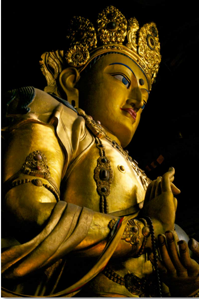
Statue of Avalokitesvara at Gandan Monastery.