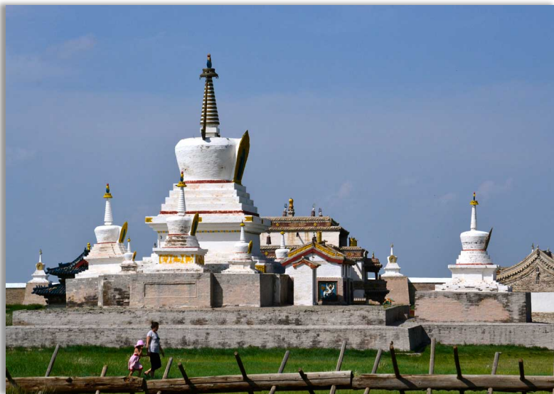
Main stupa at Erdene Zuu monastery.

evening, enjoy a traditional Mongolian barbeque for dinner.