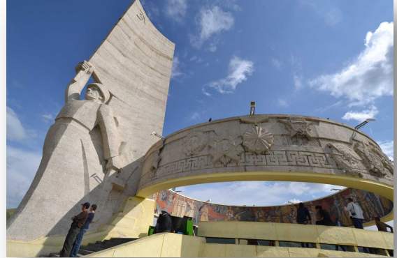
Zaisan memorial.

In the afternoon, we will make a short city tour including a stop at the towering Zaisan Hill, where you can get a bird's eye view of the entire city, huddled in between the valley of Tuul River and Bogd Khan Mountain. This scenic mountain is believed to be the first national park in the world. The Mongolian State Library keeps copies of letters exchanged between the governor of Ulaanbaatar and Qing Emperor from 1778, mentioning local celebrations arranged for the occasion of making the Bogd Khan Mountain an official protected site.