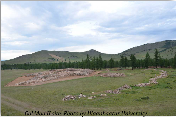
Gol Mod II site.

Our destination of the day will be Uran Togoo, a beautiful dormant volcano surrounded by mountains, forests and colorful wild flowers. We will have a chance to exercise and trek in the foothills of the mountains. Overnight in tents. (Tent Camp; B, L, D)